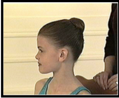
Required Bun All Ballet Classes