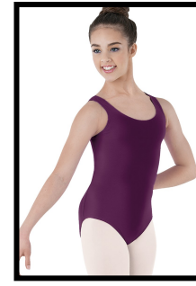
Ages: 11 & 12