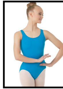
Ages: 9 & 10