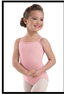
Ages: 3 to 8